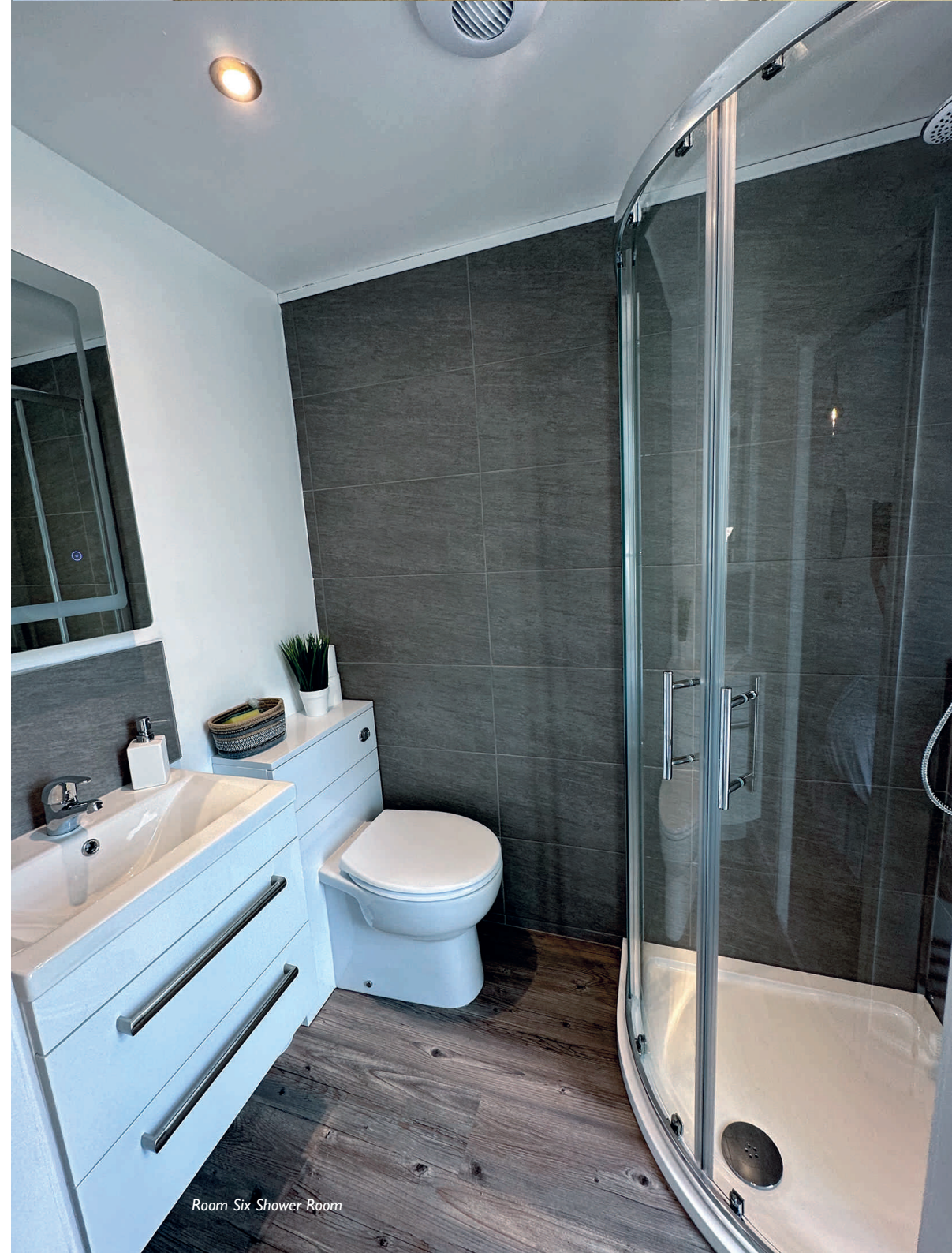
Room Six Shower Room

Brand new refurbished bedrooms with new showeroom facilities. We have 5 star guest reviews for comfort and cleanliness too!