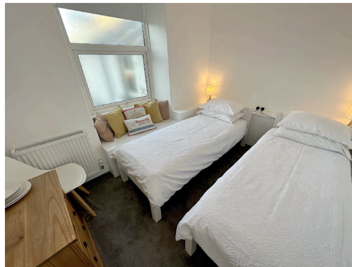
Room Three / Extra Bedroom