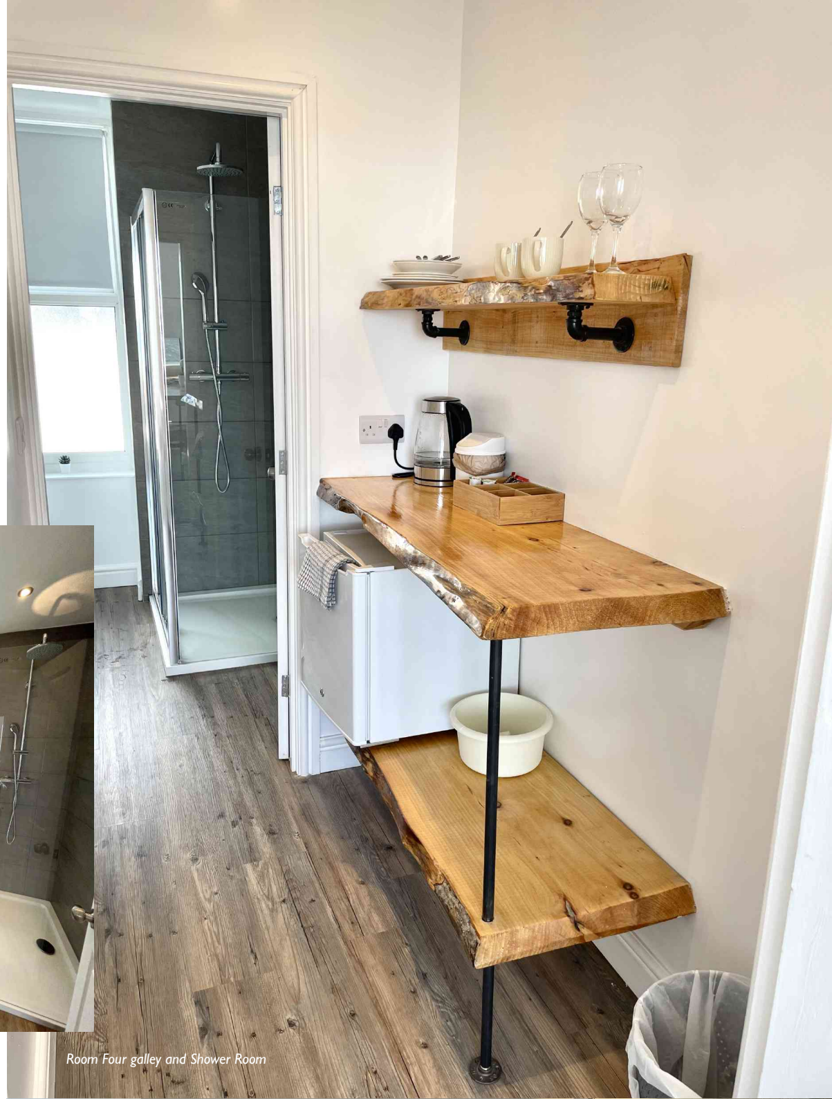
Room Four galley and Shower Room