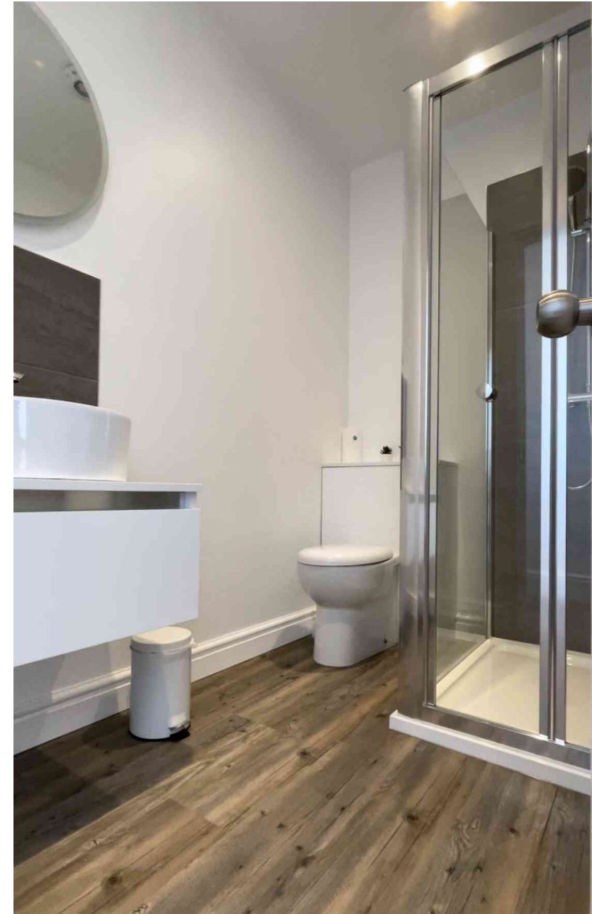
Room Three Shower Room

Enjoy modern refurbished rooms at Môr Heli. All exposed timbers were locally harvested from sustainable forests in Pwllheli, North Wales.