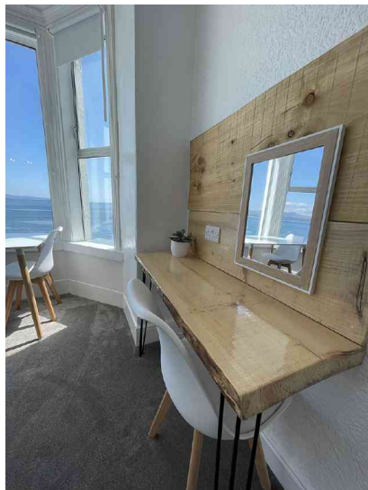
Dressing Table area