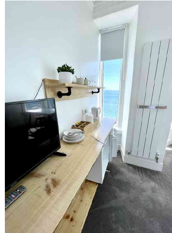
Tea, Coffee & Mini Fridge

Smart TV and WiFi as standard. All Môr Heli rooms have modern en-suite showers and toilets.