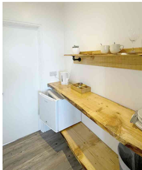
Room Two Tea and Coffee Galley with Mini Fridge