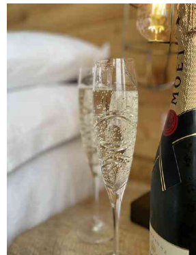
Special occasion? We can help

Room Two has a small galley area for Tea and Coffee making and a mini fridge to keep your Prosecco and nibbles cool and let's not forget Smart TV and WiFi as standard. All Môr Heli rooms have modern en-suite showers and toilets.