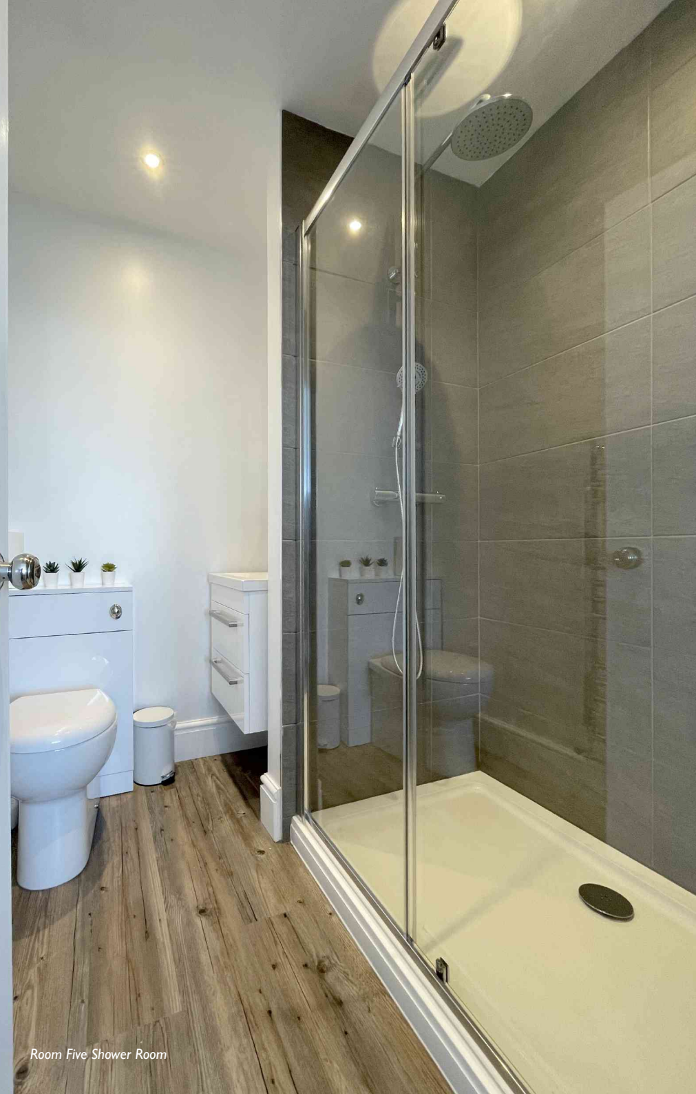
Room Five Shower Room

Thinking of making your stay extra special? We can help organise a bottle of fizz or flowers or other requests (as best we can) on arrival.