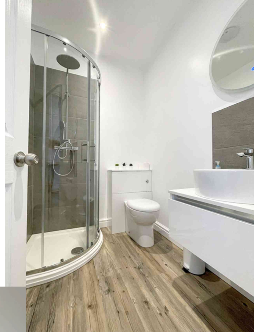
Room Two Shower Room